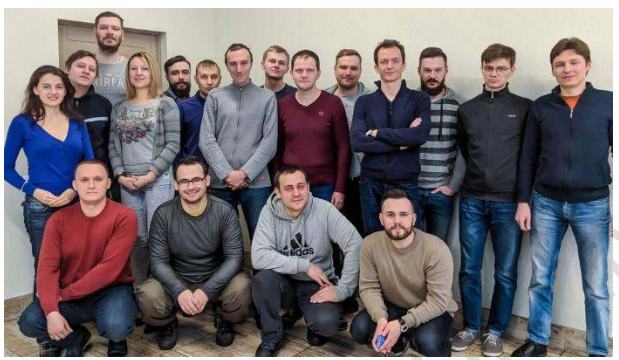
Our core-dev team

Despite the advantages, there are still risks related to acquiring ICURY tokens, which are limited to transfer fees during pilots as long as tokens are provided for free. The value of a token might fluctuate if there's speculation, and there's the risk that a token loses its value completely (again), or that there is no trade in tokens possible. In case that Icecat wouldn't be able to mitigate critical legal, PR, business, economic or other risks that are typical for its business or for crypto-tokens, it might not be able to buy back its token and/or accept the token against services. Please, read carefully the disclaimer in the footer and the disclaimer and risk sections of the Whitepaper in full.